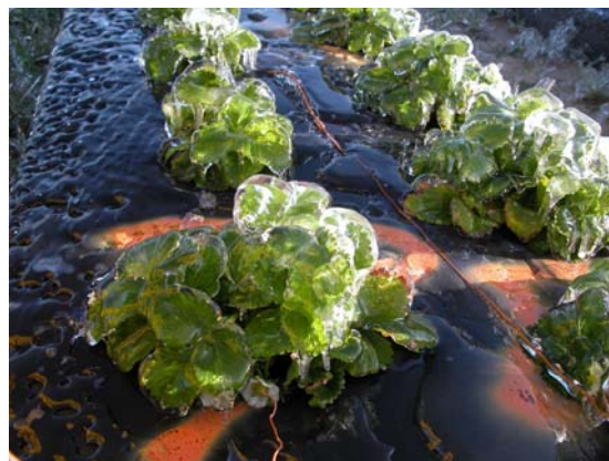
Figure 1b. The thermocouple wire inserted in the open blossom can be “read” on the hand-held digital thermometer; this, in turn, helps us to decide when it is safe to turn-off in the morning (when the blossom temperatures are above 32-33 F).

Kirby is holding a hand-held digital thermometer.